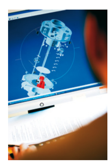
PARAT Halvorsen AS engineers work with state-of-the-art 3D modelling and analysis software.